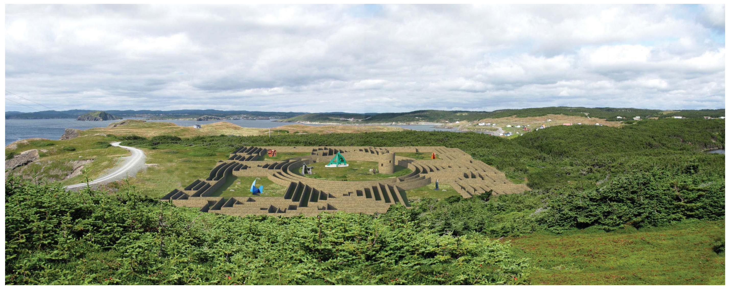
PROPOSED MAZE WITH SCULPTURES