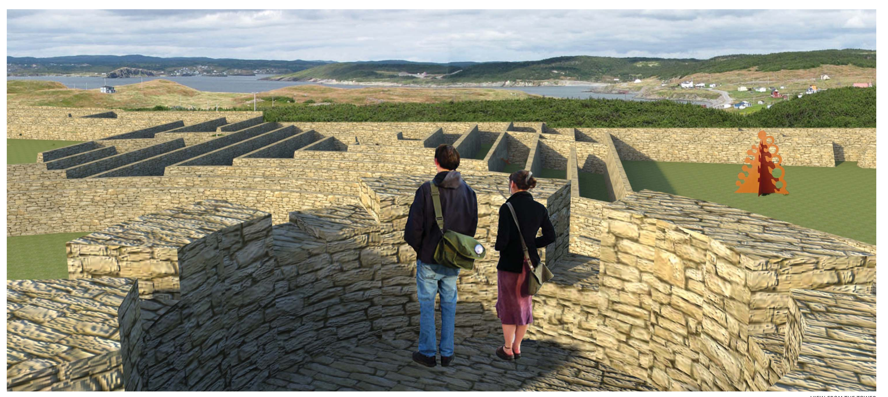
VIEW FROM THE TOWER