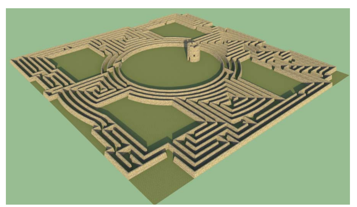
VIEW OF EXISTING SITE BIRD'S EYE VIEW OF SKETCHUP RENDERING