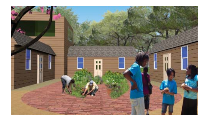
PERSPECTIVE OF KITCHEN GARDEN

The world healing garden represents a cross section of healing herbs brought by visitors from around the world highlighting the universality of healing traditions and the importance of passing on that knowledge to all who visit, work and live at Black Oaks. The garden is quartered into Western, Ayurvedic, Traditional Chinese and Native American Herbal Medicine traditions. The entire outer circle of the garden contains herbs that aid digestion, particularly the stomach and liver. The middle circle contains those plants that help respiratory function in particular. The innermost circle contains those plants that help mental and spiritual function. Through this organization, the visitor can see where in the human body the plants can help across the diverse healing traditions. As the plants grow, cuttings and root divisions can be replanted elsewhere on the property or given as starts to other similar learning landscapes.